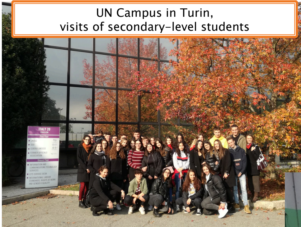
UN Campus in Turin, visits of secondary-level students