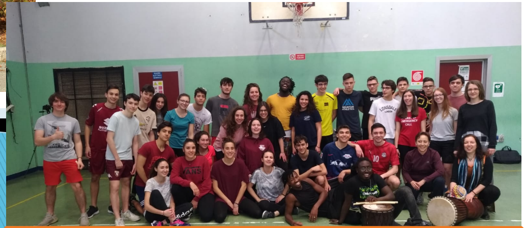
Turin, 19/02/20 – Project “Different and Equal: global citizenship education”